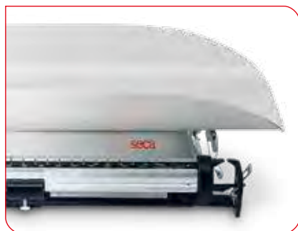
To simplify cleaning, weighing tray can be removed.

The weighing tray is easy to remove from the base for cleaning. The hard-wearing, scratch-proof finish and the smooth, seamless surface makes the seca 725 extremely easy to clean.