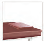
Matching Pillow MPOO