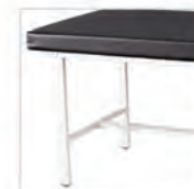
*Special Height Legs